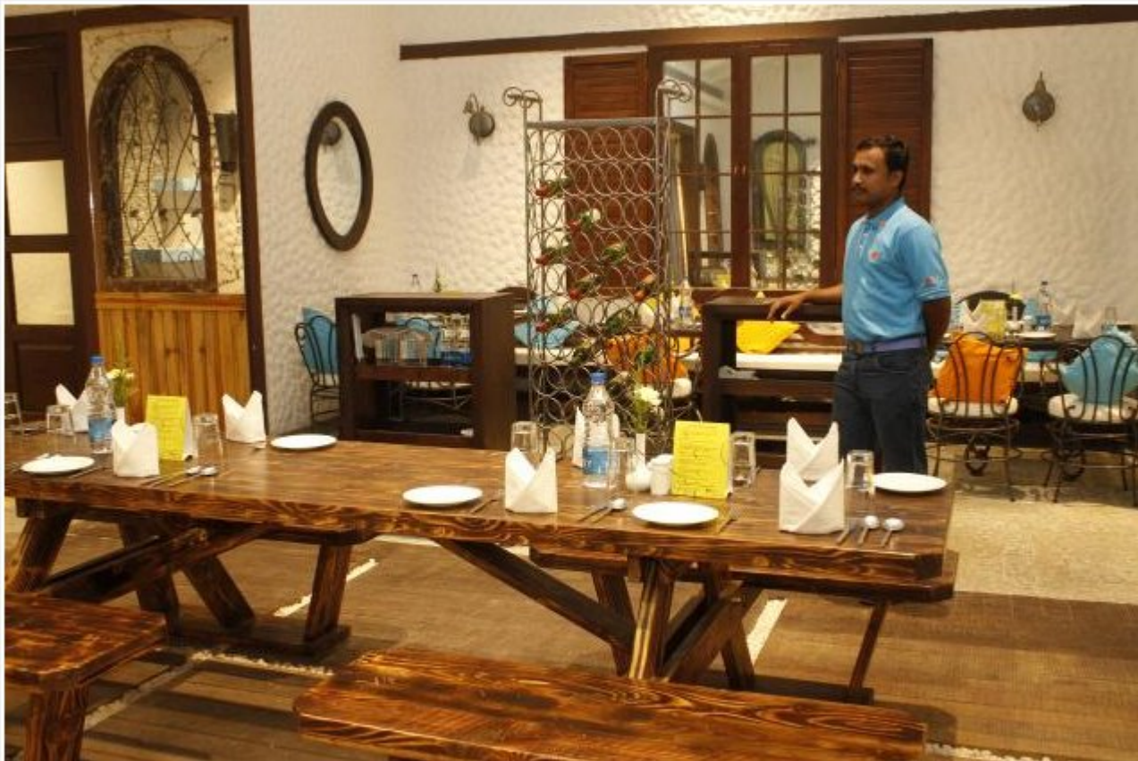
The fine dine restaurant Estia